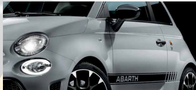
5HN - Black (Option)