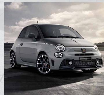
618 Pista Grey / Campovolo Grey / White Line Option on Competizione