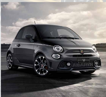
343 Scorpion Black / Record Grey / White Line Option on Competizione