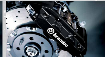
83Y - Brembo Black Calipers (Option on Competizione)