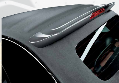
Titanium Grey Roof with Matte Titanium Spoiler (Option)