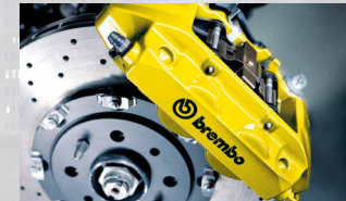
4SU - Brembo Yellow Calipers (Option on Competizione)