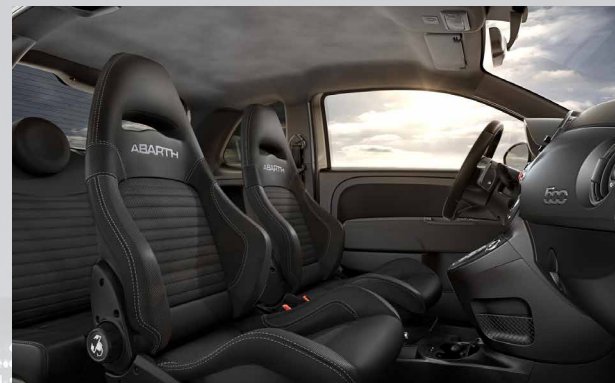
430 - Leather & Alcantara Sabelt Seats (Option on Competizione)