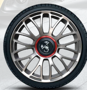
3KV - 16-Inch 10-Spoke Diamond Finish Wheel (Option on 595)