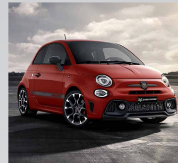
176 Abarth Red (Solid) Option