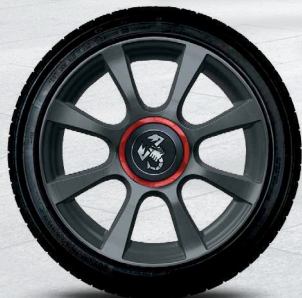
5EV - 16-Inch Wheel (Standard on 595)