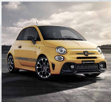
258 Modena Yellow (Solid) Option