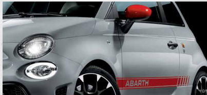
5HI - Red (Option)