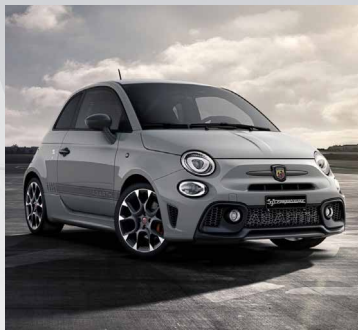
676 Campovolo Grey (Solid) Option