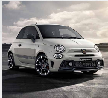
268 Gara White (Solid) Standard