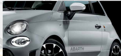
5HM - White (Option)