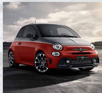
627 Pista Grey / Abarth Red / White Line Option on Competizione