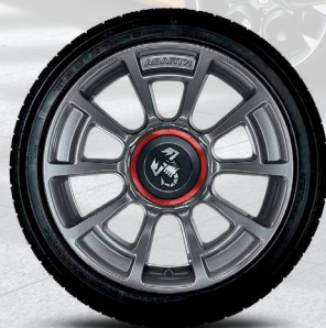
5ER - 16-Inch 5-Spoke Retro Wheel (Option on 595)