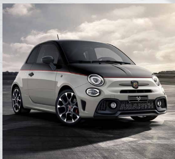
220 Scorpion Black / Race White / Red Line Option on Competizione