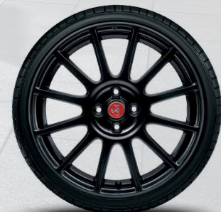
3KR - 17-Inch Supersport Matte Black Wheel (Option on Competizione)