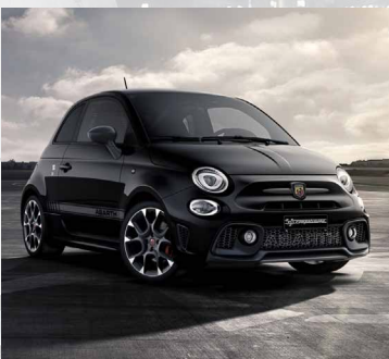
876 Scorpion Black (Metallic) Option