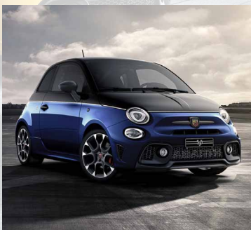
626 Scorpion Black / Podium Blue / White Line Option on Competizione