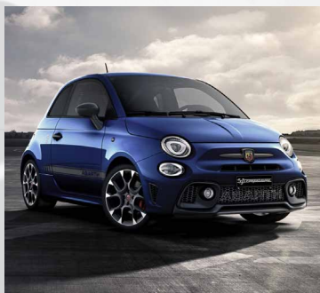
369 Podium Blue (Metallic) Option