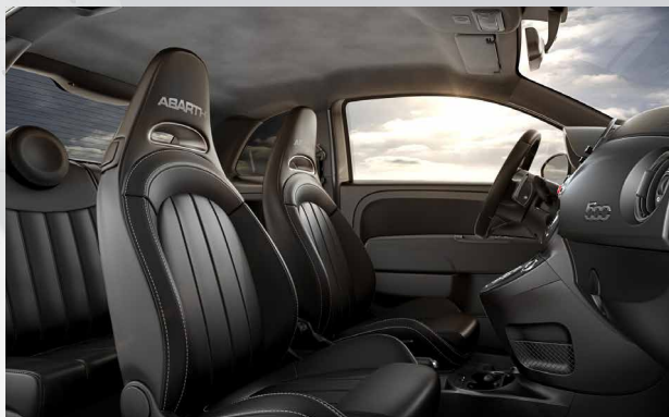
402 - Abarth Black Leather (Standard on Competizione)