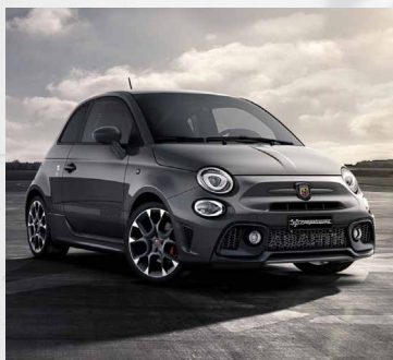
695 Record Grey (Metallic) Option