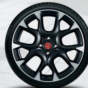
6JC - 17-Inch Wheel (Standard on Competizione)