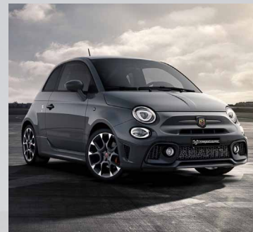
735 Pista Grey (Solid) Option