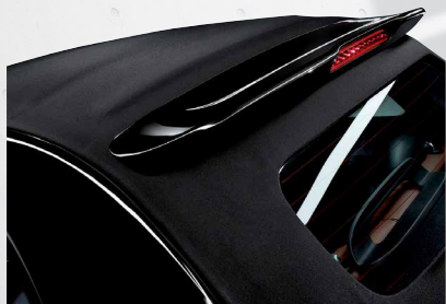
Black Roof with Matte Black Spoiler (Option)