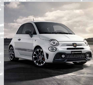
227 Ice White Tri Coat Option